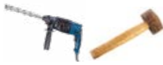
A Hammer Drill B Lump Hammer