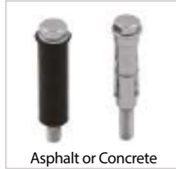
#4 Hex Head Fixing Bolts