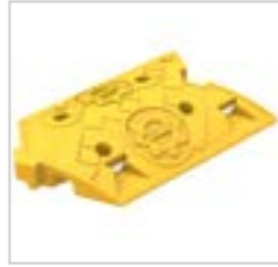
#2 Yellow Inner Sections