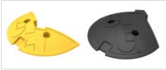
#1 End Cap Pairs 1 x Yellow, 1 x Black