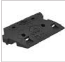
#3 Black Inner Sections